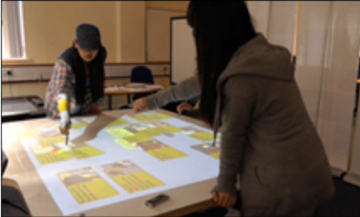
Figure 2. Group C: sorting

It was evident in more than one instance that the ability to enlarge the slips prompted reading aloud, encouraged discussions around its content, and pulled students together in the task. All the information visible on the table provided a space of learning (Walsh, 2011) to scan information, search for links between them, reflect on their thinking and make necessary changes (Figure 3). This facility made a high-cognitive-demand activity manageable (Cummins, 2008) with regard to both thinking and speaking in a foreign language.